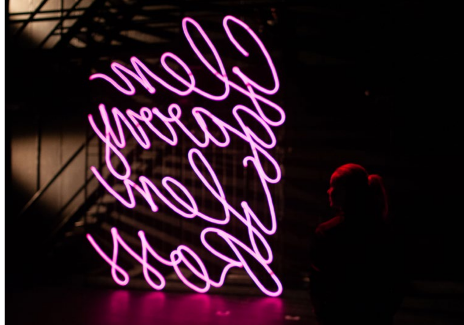
MANY PERFORMANCES WITH ENGLISH SUBTITLES