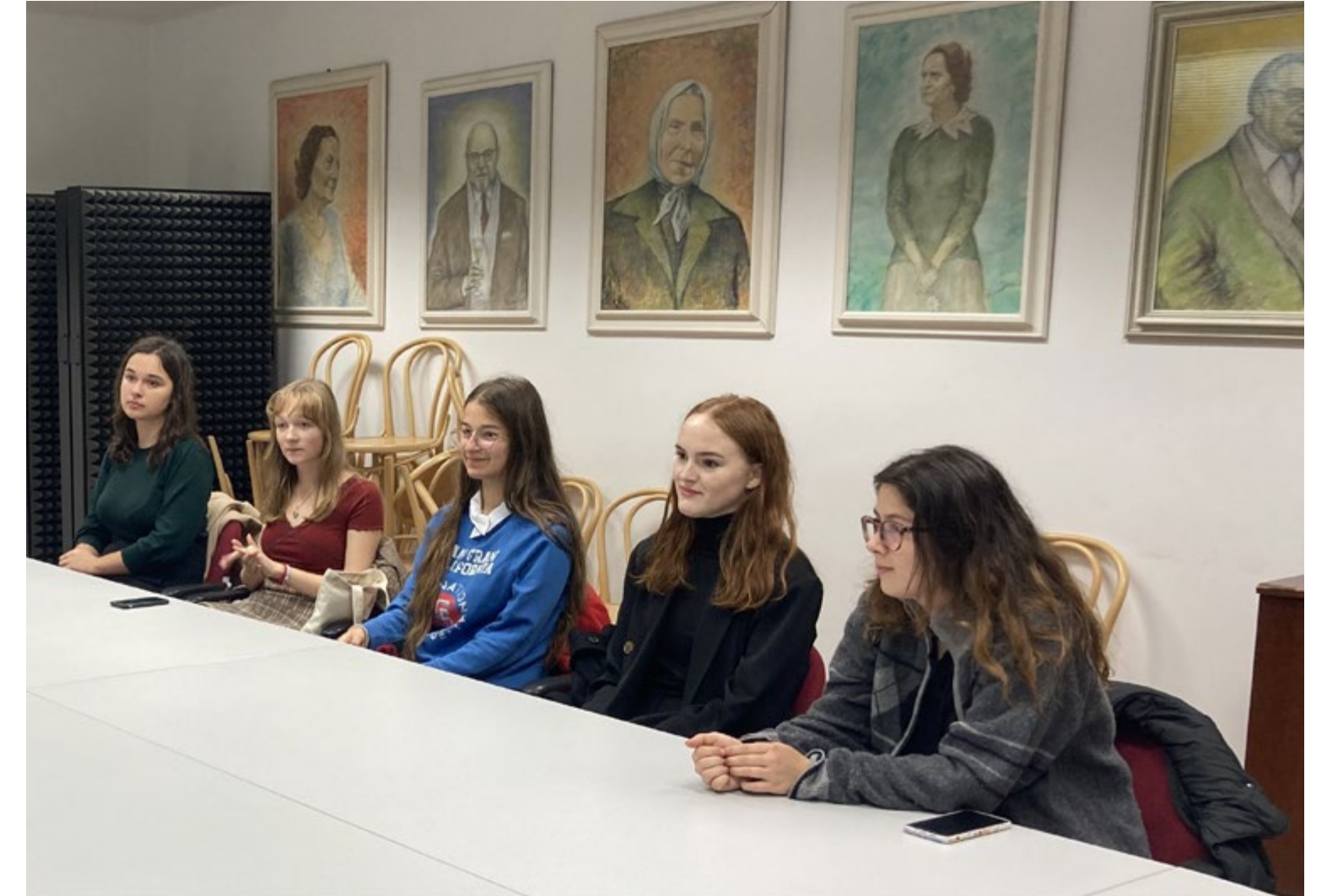
CREATIVE WRITING WORKSHOPS